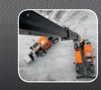
Payload and Working Height The JLG RS Series feature a 3.6t/4.0t max. lift capacity and a 14m/17m max. lift height respectively.

Straightforward to Service Simplified boom design so there is less service and easier access provided.