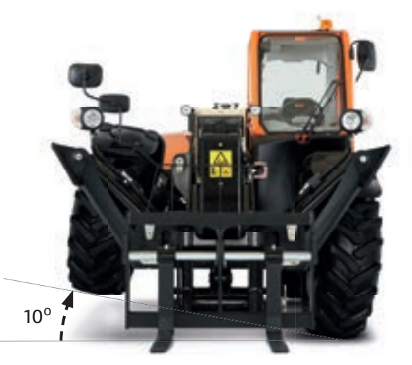
FRAME LEVELLING The front axle of the 3614RS and the 4017RS can oscillate on slopes up to 10 degrees.

JLG RS Series telehandlers are designed to take on almost any kind of job. A high ground clearance, with a low center of gravity and 4-wheel drive is a particular advantage traversing rough terrain. Standard frame leveling adds to your level of efficiency, especially when loading on slopes and uneven terrain.