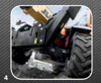
Proven Power Train Both RS Models come standard with integrated powershift 3-speed transmission and feature Dana axles.